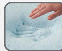
Gel Infused Memory Foam