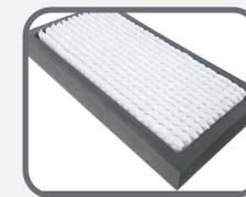
Pocket Coil with Foam Encasement